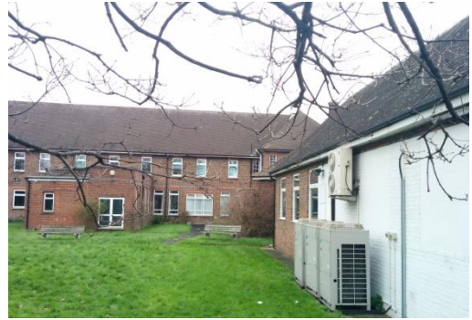
Functional servicing and air conditioning units