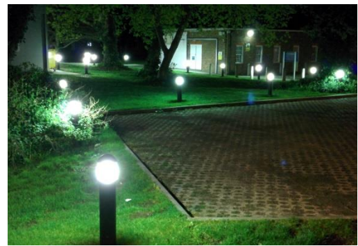
Intrusive lighting and road signs within the site