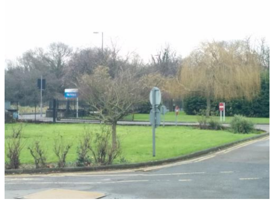
Formal open space