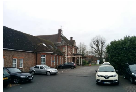
Poorly located car parking dominating formal landscaped setting