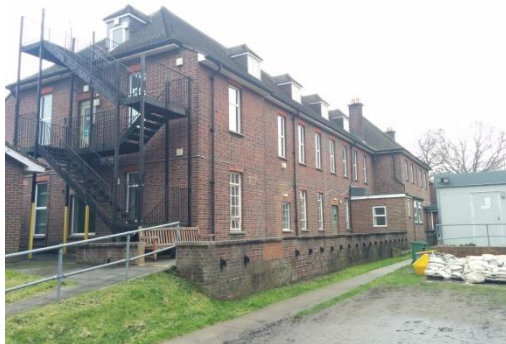
Insensitive fire escapes