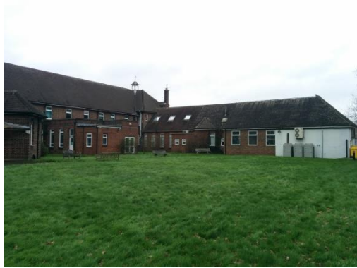
Underused green space