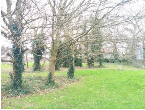
Important tree cover