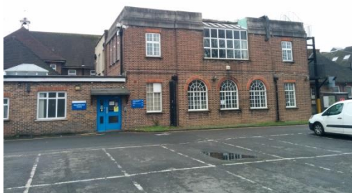
Inconsistent window details