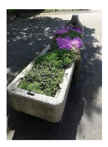
The horse trough at Jubilee Corner, which is cared for by one of our members

2018 was a challenging year for the natural environment. A wet spring was followed by an abnormally warm and dry summer that put extreme stress on trees. Not only were new plantings at risk from lack of water, but even mature specimens, including evergreens, struggled for sufficient moisture and succumbed. Where dead street trees had been replaced by the council, volunteers across the borough routinely watered the newly planted trees, with varying degrees of success. Sadly, the preferred out-sourced contractor was only seen with water bowsers on Mitcham streets when the dry spell had ended.