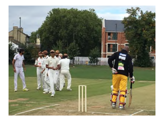
The Lashings World XI come to Mitcham

Our new Ladies team had a lively inaugural season and we hope to grow numbers in 2019. Despite all the off-the-field challenges we continue to make progress in implementing our Development Plan. Notable achievements include the restoration of artificial net facilities.