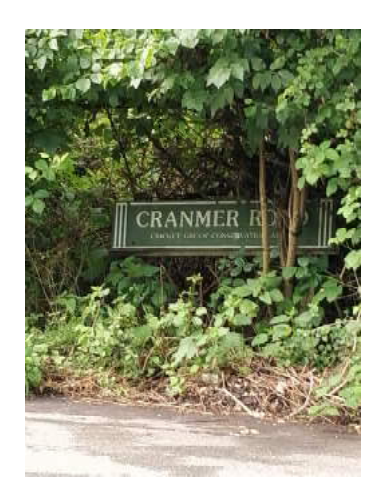
One of the Conservation Area road signs, surrounded by greenery

took place. The consequence was wet clumps of mown material being pressed into the ground by the tractor wheels. When the weather changed from wet to warm and dry, these clumps baked hard, allowing no space for the grass beneath. The hot spell had little long-term effect on grass, which can withstand long periods without water. However the clumps of compressed cuttings killed large swathes of grass, especially noticeable on the west lawn of The Canons, on Cricket Green opposite the Police station, and on the out-field of the cricket pitch which resembled a moss, weed and earth patch. There was no reseeding of damaged areas.