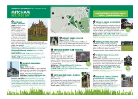
Mitcham Heritage Day 2018 saw more participating organisations than ever and hundreds of visits

We took to the wider stage in May, joining in with the Merton Heritage Discovery Day held at the Civic Centre, where our stall was packed full of information and our talk, on the topic of "Discovering The Canons and Mitcham Cricket Green" was given to a full house.