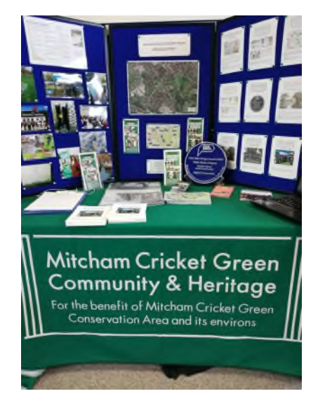
Our stand at the Merton Heritage Discovery Day in May

We were all delighted to see Mitcham Cricket Green Conservation Area come fourth in a national poll to find England's favourite Conservation Area, run by the charity for England's civic societies, Civic Voice. When you consider that there are more than ten thousand Conservation Areas in England this is a really exceptional achievement, and proves what we know locally – Mitcham Cricket Green Conservation Area is an absolute gem that's well worth all the hard work and effort people put in to look after it.