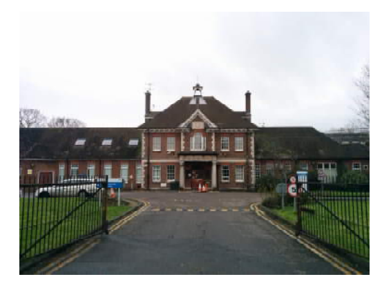
Transformation of The Wilson into a local care and wellbeing centre was frustrated by delays

Enforcement of planning safeguards continues to be an Achilles heel at Merton Council and we pressed for action on illegal parking, unauthorised development, fly tips and problems caused by the school run. We also highlighted the problems caused by a growing proliferation of estate agent boards as more flats are developed.