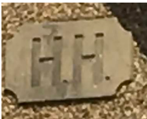
Langdale Avenue – “H.H.”