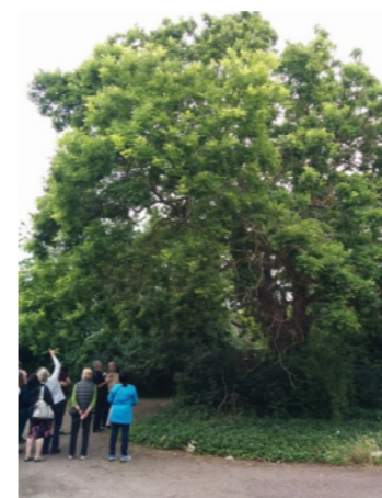
Merton's favourite tree 2019 in the former Canons nursery

The year ended on a high. As part of the 50th anniversary of Cricket Green Conservation Area we planted a new hedge of golden privet on two sides of the cricket boundary – a real community effort.