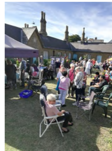
Mitcham Heritage Day at Mary Tate Cottages

The highlight of our events year was once again Mitcham Heritage Day. This event grows each year, and in 2019 we welcomed new participants Mitcham Golf Club, Melanie's Walks and Mary Tate Cottages, each offering their own special take on the heritage theme. Mary Tate Cottages held a popular tea party, widely enjoyed, while the golf club put on displays of traditional golfing equipment, clothing and the history of the club.