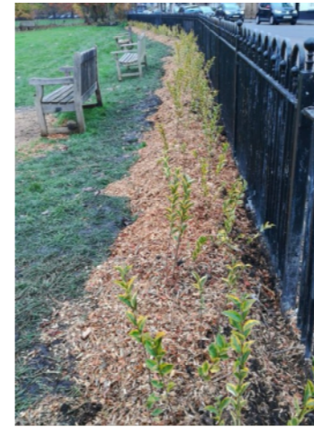
A golden privet hedge planted for the 50th anniversary of Cricket Green Conservation Area

We were encouraged the Local Government Boundary Commission agreed with our suggestion to align the Cricket Green ward boundary with the Conservation Area near to Three Kings Pond.