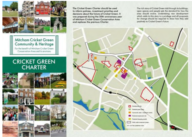
Our refreshed Cricket Green Charter

The Charter calls for the highest standards of design with a new design code and an expectation that any development facing one of the greens should be of a quality that could be listed within 30 years.