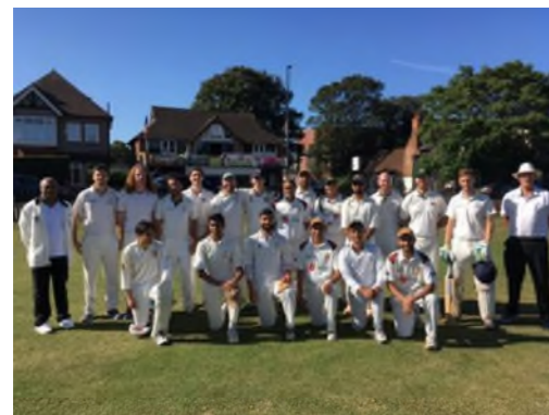
A Mitcham Cricket Club team with the pavilion in the background

Frustrations continued regarding the tenure on the cricket club's pavilion. After a long wait our landlords eventually responded to the Club's request for a price for the freehold of the site. The price quoted was three times the independent valuation of our current footprint. Meanwhile their plans for a hotel, and later for a care home, have not progressed.