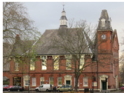
Vestry Hall on Lower Green West

When Mitcham was a self-contained local authority in its own right, the Vestry Hall on Lower Green West was the focus of local government. The advent of the London Borough of Merton in 1965 heralded the loss of this dignity, with ensuing detriment to the perceived appreciation of the place. In fact, a consultant described Lower Green as being just a "roundabout".