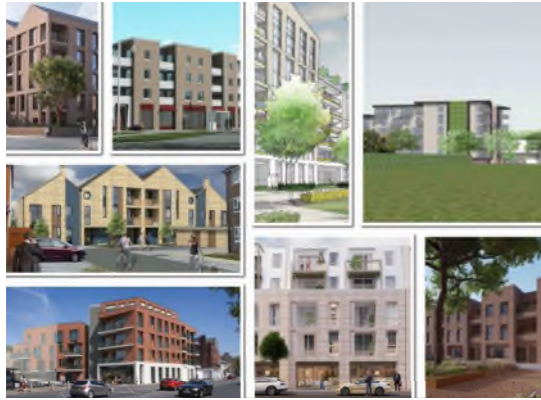
The year ended with the area facing unprecedented plans for over 1,000 new flats in eight separate planning applications

Ignoring local feedback we also saw SUEZ bring forward a massive increase in its plans for Benedict Wharf to develop 850 homes reaching up to 10 storeys.