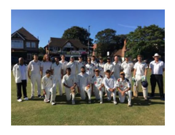
A Mitcham Cricket Club team with the pavilion in the background

Frustrations continued regarding the tenure on the cricket club's pavilion. After a long wait our landlords eventually responded to the Club's request for a price for the freehold of the site. The price quoted was three times the independent valuation of our current footprint. Meanwhile their plans for a hotel, and later for a care home, have not progressed.