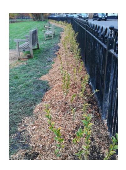
A golden privet hedge planted for the 50th anniversary of Cricket Green Conservation Area

Other pressures on trees during the year were manifold. Cars parked on grass verges at Three Kings Piece, compacting tree roots, were partially discouraged by Merton Council extending the railings, but not far enough south to cure the problem. This stretch was further threatened by a plan to dispense with grass in favour of a wider cycle road.