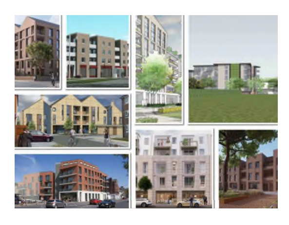
The year ended with the area facing unprecedented plans for over 1,000 new flats in eight separate planning applications

Ignoring local feedback we also saw SUEZ bring forward a massive increase in its plans for Benedict Wharf to develop 850 homes reaching up to 10 storeys.