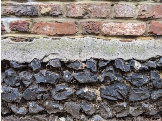
Beauty and nature at Mitcham Cricket Green

The townscape of Cricket Green Conservation Area remained in a state of flux due to the absence of redevelopment of the former filling station site and the failure of any suitable ongoing uses emerging for the Burn Bullock and White Hart inns.