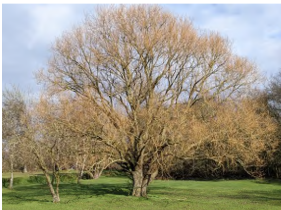
Beauty and nature at Mitcham Cricket Green

Yet there were successes during the year. London in Bloom was held virtually, being judged on photos including those of private gardens. For Cricket Green Age UK’s splendid show, Jubilee Corner’s alpine trough and its seasonal planted beds, plus the thriving privet hedge led to us winning a special commendation for our Conservation Area.