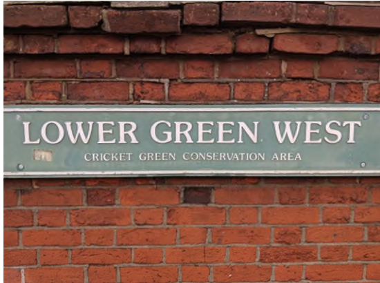
Beauty and nature at Mitcham Cricket Green

With much of 2020 spent under various grades of 'lockdown' opportunities for Mitcham Cricket Green Community & Heritage members to meet each other were strictly limited. We were unable to hold our regular monthly meetings, which are so popular in bringing so many of our members together both for social contact and to play their part in informing how we proceed with day to day business such as commenting on planning applications.