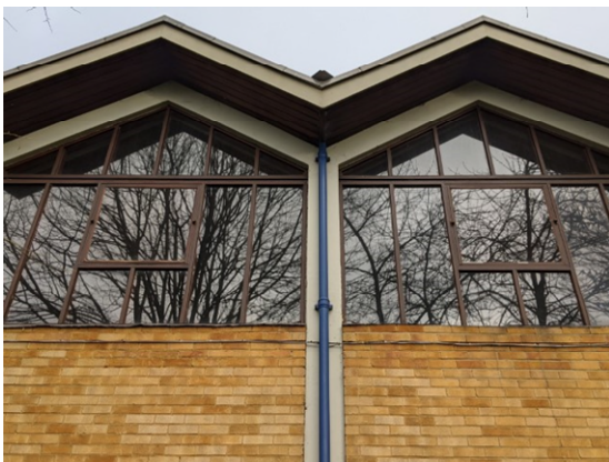
Beauty and nature at Mitcham Cricket Green

Despite all the upheavals in the world 2020 was a year of unprecedented pressure on Cricket Green, especially from plans for over 1000 flats across eight development sites within 10 minutes' walk of the cricket ground.