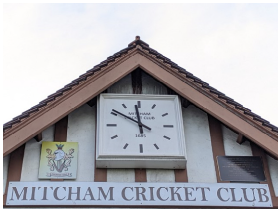
Beauty and nature at Mitcham Cricket Green

For Mitcham Cricket Club, like everyone else, it was an unprecedented year.