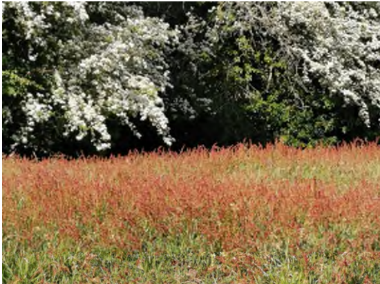
Beauty and nature at Mitcham Cricket Green

We spent most of 2020 in the grip of a virus that killed millions around the world. In the UK, as in other countries, reducing the spread of the virus meant periods of zero or minimal personal contact. Social and other public events were not allowed, and numerous businesses had to close for many weeks. It was a challenging year in our personal lives, and Mitcham Cricket Green Community & Heritage, like so many other organisations, also felt the effects.