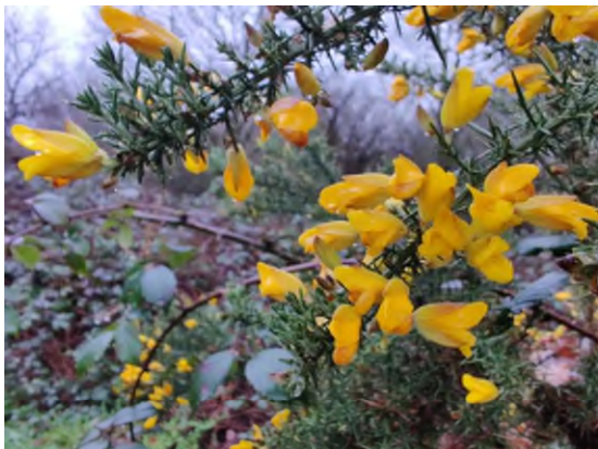
Beauty and nature at Mitcham Cricket Green

Every cloud has a silver lining. For the local vegetation, the cloud of Covid, making its appearance early in 2020, led to an abundance of growth not seen for decades.