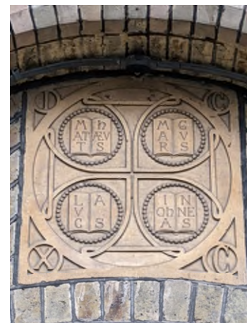
Beauty and nature at Mitcham Cricket Green

Mitcham Cricket Green Community & Heritage is the civic society for the Mitcham Cricket Green Conservation Area and its environs. We are part of the wider civic movement through membership of the national charity Civic Voice.