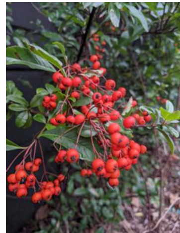
Beauty and nature and heritage at Mitcham Cricket Green

Mitcham Cricket Green Community & Heritage is the civic society for the Mitcham Cricket Green Conservation Area and its environs. We are part of the wider civic movement through membership of the national charity Civic Voice.