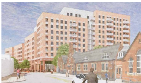
Clarion's monstrous plans for flats rising to 11 storeys on the old Morrisons site and Majestic Way provoked a strong negative response

We invested considerable effort working to protect Mitcham's village character in the face of major building plans which will shape its future for generations to come.