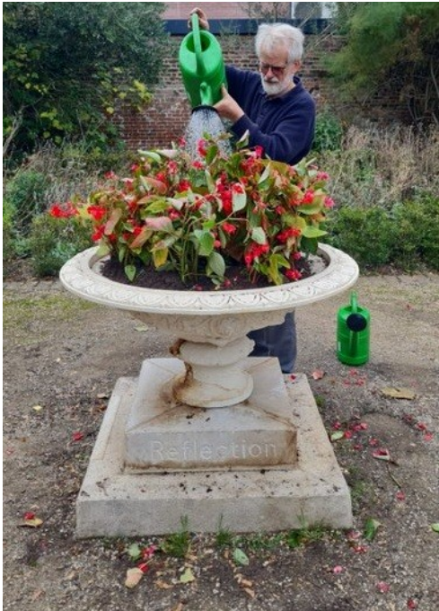
Begonias lifted from formal beds found a new home in the walled garden till winter frosts hit

Despite promises nothing was received from LBM so we carried out our own count. Unsurprisingly we noted a considerable shortfall in the quantity of whips planted. On a positive note, the survival rate looked promising.