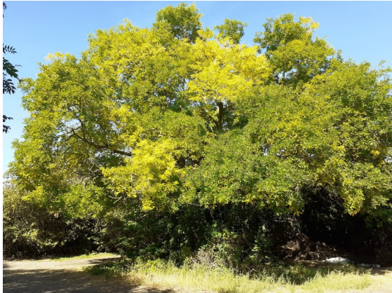
The magnificent Pagoda Tree whose fate lies in the balance despite Merton Council's paused plans to build on the historic Canons nursery

Our work on other development proposals secured some important results.