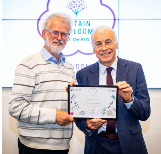
Seven entries submitted to London in Bloom won awards this year

Our ongoing participation in London in Bloom generated more successes this year, further boosting Mitcham's environmental standing.