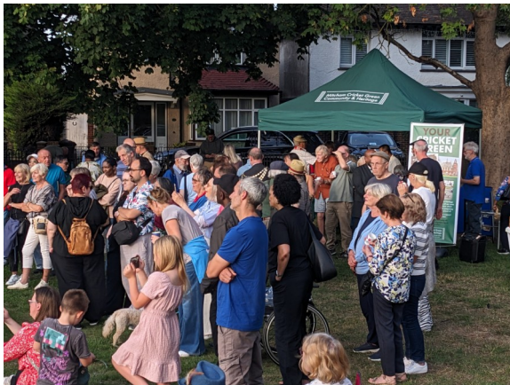
Community on the Green was enjoyed by several hundred local people

Our September quiz night has now become an annual fixture, and it draws teams from Cricket Green and beyond. With a raffle and wine tasting alongside several rounds of quiz questions with a prize for the winning team, and a fish and chip supper this event provides an evening of fun for all.