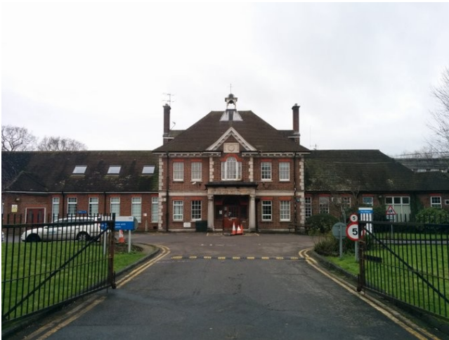
Yet more delays and an official policy statement of "fudge in terms of the opening date" for the Wilson, originally planned to open in 2020

Regular meetings with SUEZ about its waste site on Benedict Wharf kept problems of heavy lorries and pungent smells high on the agenda. We are working hard to secure commitments from SUEZ and Merton Council for planters on the barren Hallowfield Way and are pressing Merton Council to back action to remove the narrow part of Church Road as an official lorry route.